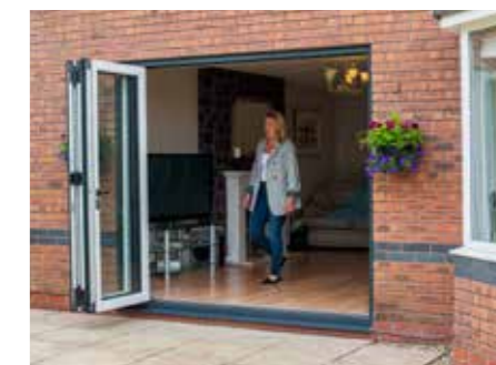
The Imagine Bi-Fold Door makes an attractive alternative to a traditional sliding patio door; completely opening your home up to the garden or patio.